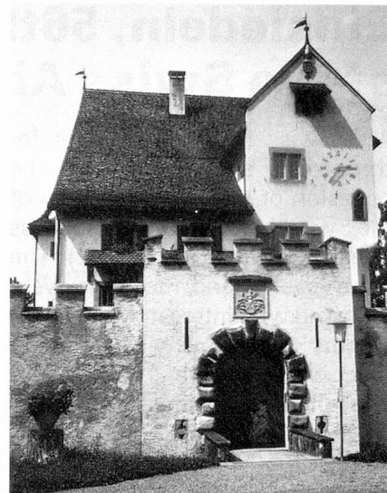
The small castle of A Pro, at Seedorf

With this we end our small excursion into the Canton of Uri. For reasons of space not all aspects could be shown, but the author hopes that he has been able to