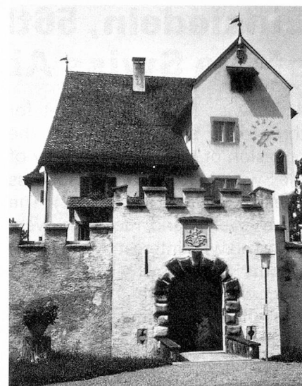
The small castle of A Pro, at Seedorf

With this we end our small excursion into the Canton of Uri. For reasons of space not all aspects could be shown, but the author hopes that he has been able to