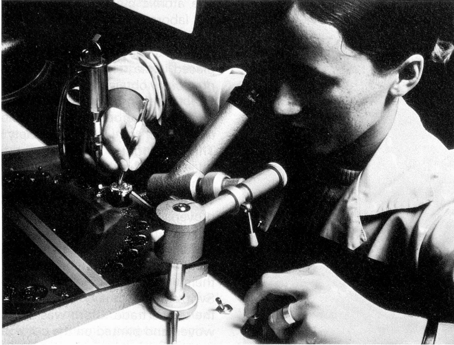
Electronics and automation in the swiss watch-making industry.

lishman Brown. The two constructed the first generators for a power station in Baden near Zurich and opened the eyes of the Swiss at the end of last century to their only raw material – water power. Today BBC build turbo-