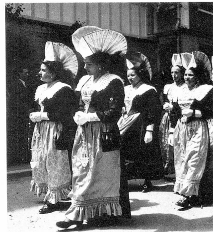
Ladies of Appenzell in her Sunday best

Herisau is particularly interesting, not only because of the circulating of the Klausen carrying huge bells, but because this does not happen on 31st December, but on 13th January according to the old Julian calendar.