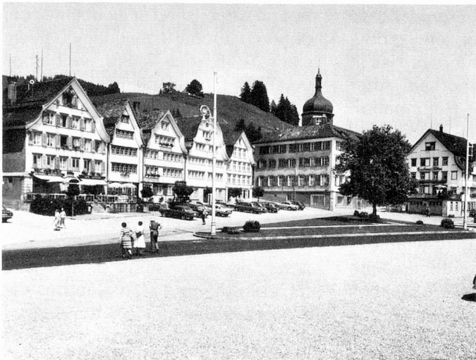
Characteristic houses in Gais