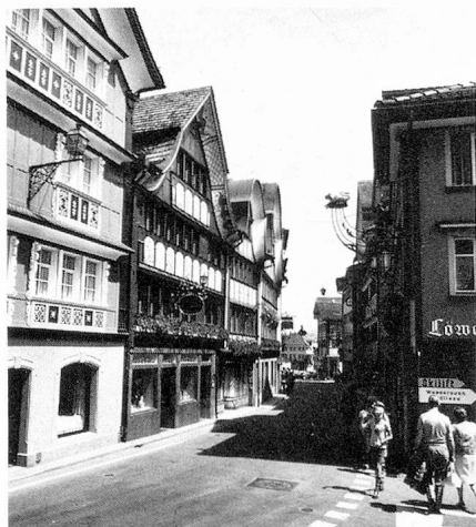
Appenzell's main street

Appenzell scenery has generally kept its peculiar charm. The fact that the economic boom was kept within bounds was probably due to unfavourable communications: just as the Romans did not include the Saentis region in their roadnets, so have the communications pioneers of the recent past left Appenzell alone as unsuitable: It is not accidental that Appenzell is the only Canton which has not a single metre of SBB and will never have a single metre of national roads either. This has cost the Canton dearly in private railways, and the burden has been lessened only in recent times when neighbours and Confederation have given some support.