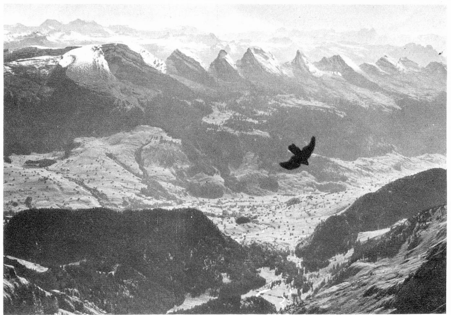
The Säntis offers breathtaking views of the Toggenburg and the Churfirsten.

of Appenzell shows certain parallels in many ways with the liberation of Central Switzerland, one finds similar events and results in the era of Reformation and Counter-Reformation. Like elsewhere in Switzerland, the Reformation could not succeed in the whole Canton. On the other hand, it was impossible to keep Zwingli's teachings out of it. In the Inner Rhoden (districts or communes), the inhabitants remained mostly Catholic, whereas the Outer Rhoden (Urnaesch – Herisau – Hundwil – Teufen – Trogen) professed the new faith. From 1525 to 1588, Appenzell people lived on a footing of equality, more or less at peace with one another. After 1580, the Counter-Reformation pressure from Central Switzerland made itself felt, and suddenly, under the influence of the capuchin monks, Protestant minorities were no longer tolerated in the Inner Rhoden , and they were expelled unless they returned to the Catholic faith. There were quarrels about the Gregorian Calendar and joining an alliance with Spain. All of a sudden one heard the word