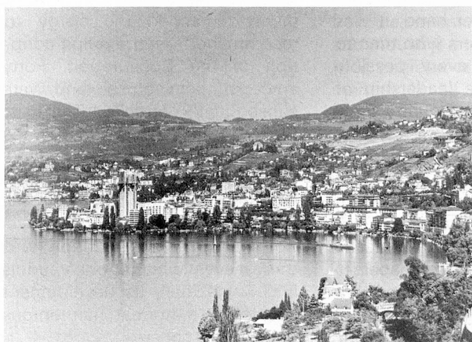
General view of Montreux.