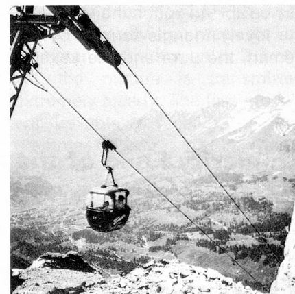
View of the massive of the Diablerets.

In the economic field, the Canton has been successful in keeping a balance between agriculture, trade and industry, and this has enabled it to achieve outstanding performances in all three sectors. Its agricultural colleges and research institutes are well-known all over Switzerland, the quality of its vintages is first-class. A whole series of undertakings in the precision industry are world-renowned; the insurance companies, the Vaudois banks – amongst them several private banks – enjoy an excellent reputation.