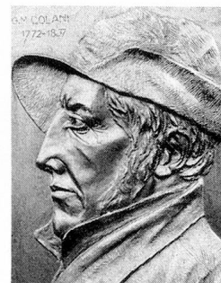
Hunter's head

As poet and narrator he writes above all in his mother tongue, the Ladin of the Engadine (poems, stories, essays, one-act plays, radio plays). More and more, he also writes in German, specially prose and dramatic works, as well as journalistic commentaries which appear in dailies and periodicals at home and abroad. Some of his publications in German are «Sgrafits» (poetry in Romansh and German 1959), Tales (Gute Schriften Zurich 1968), «Arosa» (text for a picture book, RA-Publishers Rapperswil 1972), «That afternoon at Poschiavo» (tales, Reinhardt Basel 1974), «Active Service» 1939–1945 (documentary Ringier Zurich 1975).