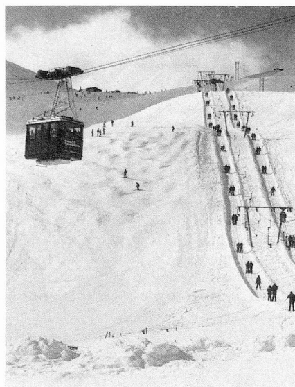
The Parsenn region near Davos has some of the most varied ski descents.