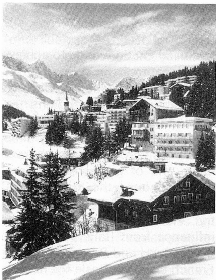
Arosa, one of Switzerland's largest winter sport resorts.

tury when the power constellations wanted to secure the Grisons passes. On one side were Austria, Spain, Milan and on the other Venice, where numerous Engadine emigrants lived, and France. Partisanship led by respected families like the Planta (in favour of the Austrians) and the Salis (Francophile) resulted in bad feuds, in which an adventurous figure like that of Juerg Jenatsch could live life to the full. Between 1649 and 1652, Austria sold her rights to the Grisons, above all to the relief of the Lower Engadine; the partisan struggles abated only gradually. The 18th century may be considered a happy period: politics and schools became aristocratised: the private schools of Haldenstein, Marschlin, were pioneering achievements of educational training; the arts and trade flourished. In 1798, the Grisons, as Canton Rhaetia, were united with the Helvetic Republic by Napoleon and became the 15th Canton of the Confederation as a result of the Acts of Mediation in 1803. The Canton gave itself a new constitution in 1814, but in fact it did not become a uniform political structure until 1854 with the demand