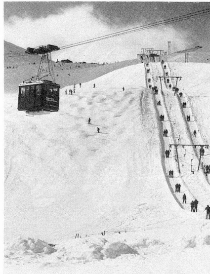
The Parsenn region near Davos has some of the most varied ski descents.