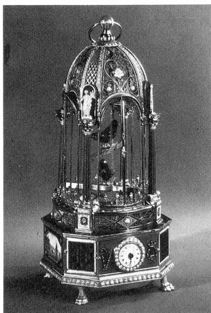
Musical clock, around 1820

Since the National Museum has a mandate to provide cultural education, science and research are given particular attention. All articles and objects already at the Museum and every newly arriving exhibit have to be entered in a detailed inventory, photographed and catalogued. The appropriate workshops and laboratories are concerned with expert restoration and conservation. Usually, a comprehensive scientific assessment is only possible after all these stages of work. The evaluation is done by way of publications such as catalogues, articles in specialised periodicals, lectures etc. Congresses, symposia and conferences at home and abroad serve further expert education as well as attainment of additional knowledge and results. An important role is played by the various excavation campaigns undertaken by the National Museum. The range covers anything from pre-historic settlement analyses in the Alps and lower Alps to fortress research in the Midlands. To this must be added unexpected tasks such as emer-