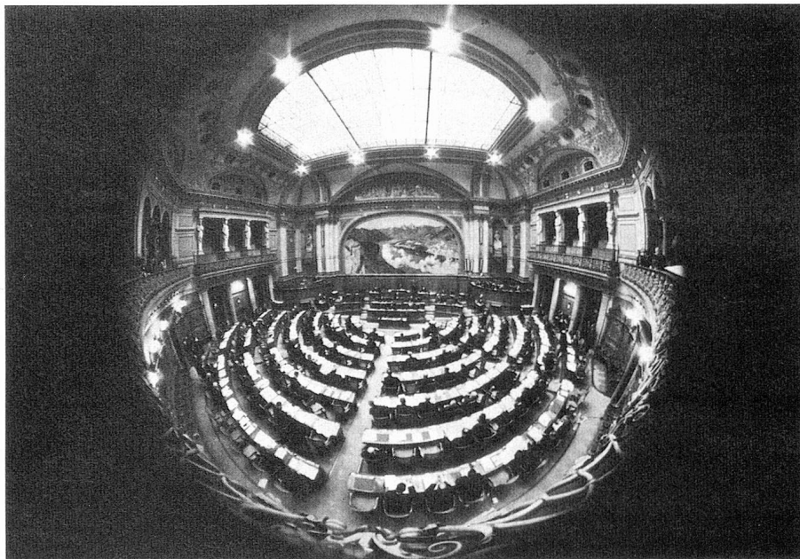
The National Council