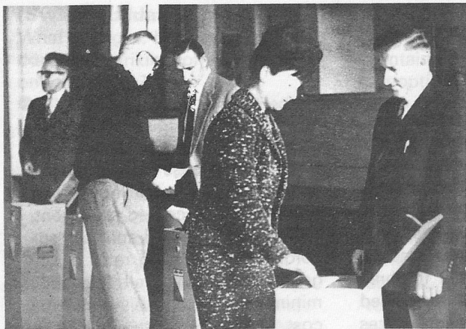
In the voting local (Keystone).