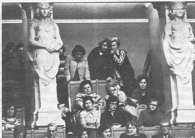
Listeners at the National Council.

special diploma schools which prepare pupils for social work, educational and nursing jobs; so far these have been frequented almost exclusively by girls.