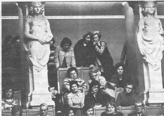
Listeners at the National Council.

special diploma schools which prepare pupils for social work, educational and nursing jobs; so far these have been frequented almost exclusively by girls.