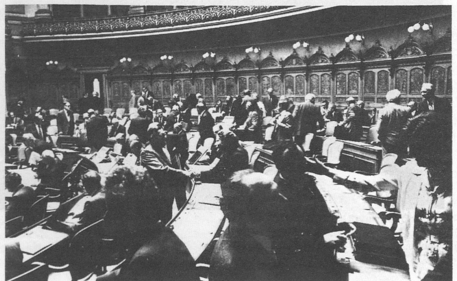
At the National Council (Keystone).