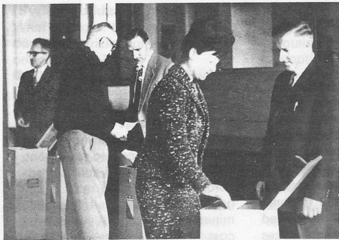
In the voting local (Keystone).