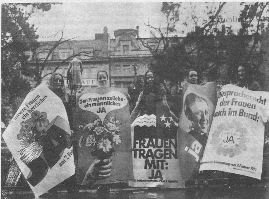
Pretty female messengers for the voting rights.

We are all born as individuals into a certain period and a certain background. The Swiss moral and legal standards accept every human life as of equal value, and thus everyone is equally entitled to the same