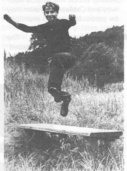
I don't see any obstacles