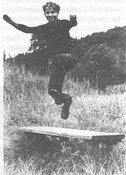
I don't see any obstacles