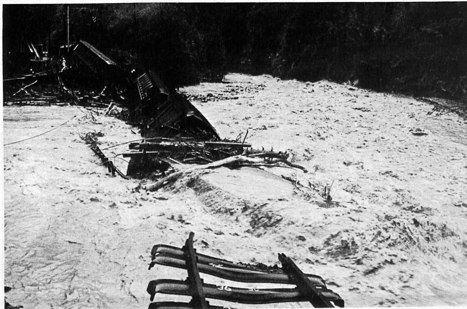
Railway accident near Davos.

fight against the decrease in personal income and the number of jobs. They aimed at preventing the production capacity of the building industry from falling to a lower level, and, in the long run, at regulating unemployment insurance and at adjusting the guarantee against export risks.