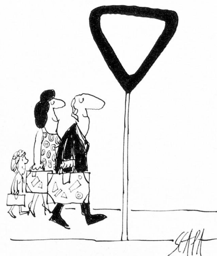
Priority to the Solidarity Fund

If it goes on like this, we shall soon be able to publish a bunch of adages sent in by readers!