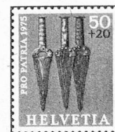
Solid-hilt bronze daggers