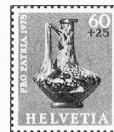
Coloured glass bottle