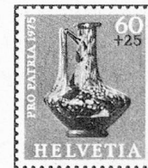
Coloured glass bottle