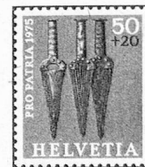
Solid-hilt bronze daggers