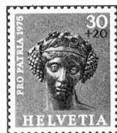
Head of a bronze statuette of Bacchus