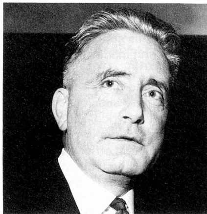
Mr G.-A. Chevallaz, Federal Councillor.

Voting participation in this matter was 39,7 percent. The draft proposal to improve federal finances was rejected by 623 548 yes to