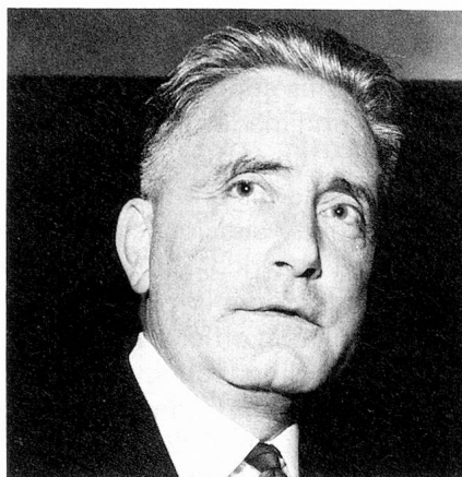
Mr G.-A. Chevallaz, Federal Councillor.

Voting participation in this matter was 39,7 percent. The draft proposal to improve federal finances was rejected by 623 548 yes to