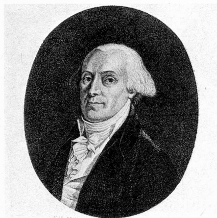
Mr Louis d'Affry, Landammann