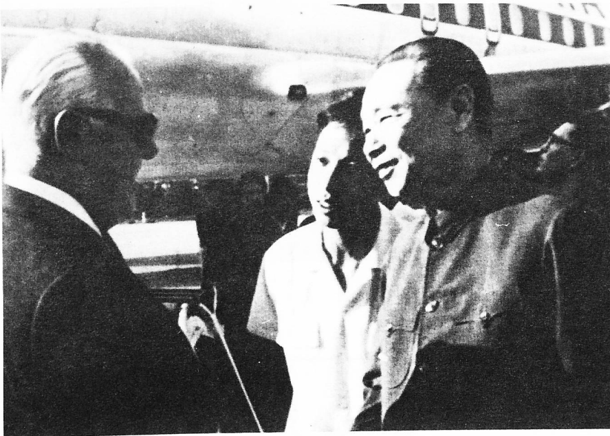
Federal Councillor Pierre Graber is received in Peking by his colleague Tschingli Peng Fei

schoolboy enabled archeologists to establish that 400 000 years ago, prehistoric beings lived in Switzerland.