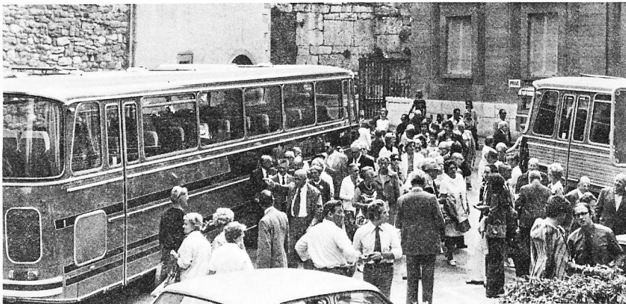
Sightseeing in Neuchâtel