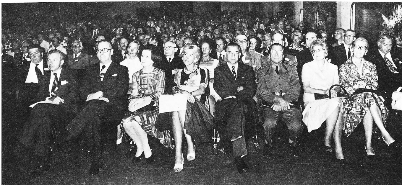
Front row: from right to left