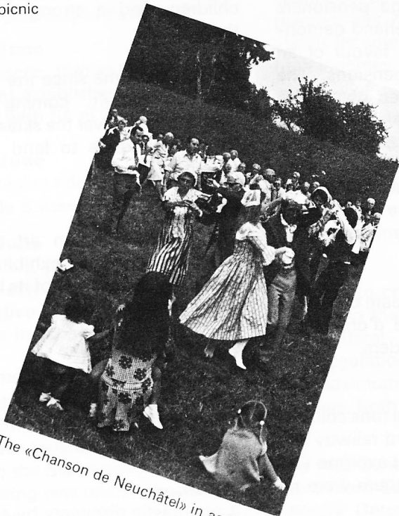
The «Chanson de Neuchâtel» in action