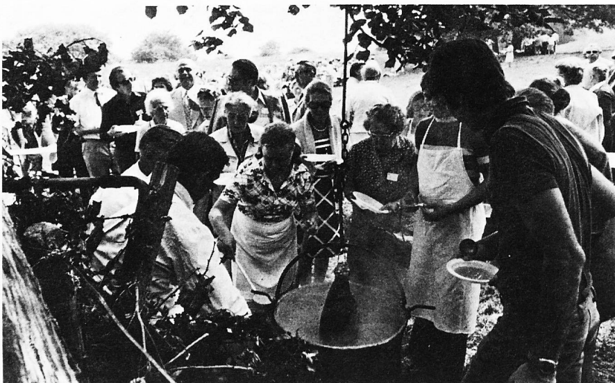
On with the peasoup!