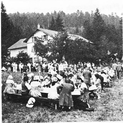
During the picnic