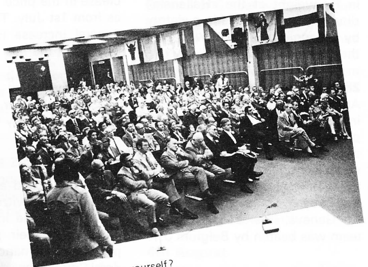
Can you recognise yourself?