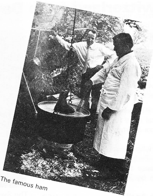
The famous ham