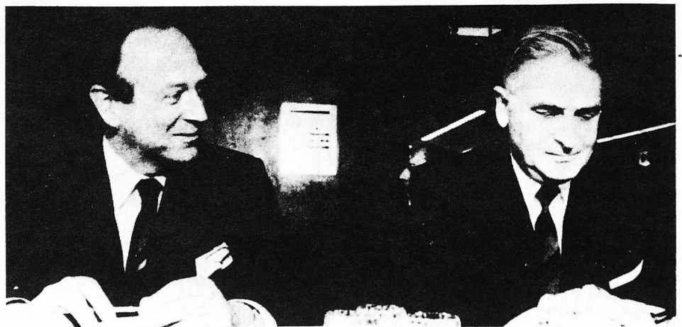
Ambassador Paul Jolles and Federal Councillor Ernst Brugger at Brussels negotiations.

It was against this direct administration that the first Swiss joined together in August 1291. Their rebellion was only the final act in a whole network of agreements and treaties on the technical level which had been previously concluded between them. In fact, the inhabitants of the valleys were far from being ignorant peasants, hiding at the foot of their mountains. Numbers of them were traders, dealing in exterior markets in Frankfurt, Geneva, Lyons, Milan... We know that one of them,