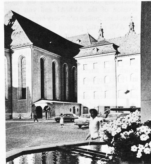
Gallus Square in St. Gall