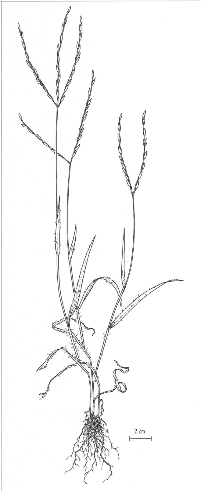
Fig. 2. – Habitus of Digitaria radicata (C. Presl) Miq. [Drawn by Sven Bellanger]

to the large-spikeleted form. Plants from France usually have spikelets 1.8–2 mm long, whereas those from Italy are characterized by spikelets up to 2.1 mm long. As a result, the European populations of D. violascens can hardly be distinguished from D. ischaemum on the sole basis of spikelet length (see Fig. 1F and Fig. 1G).