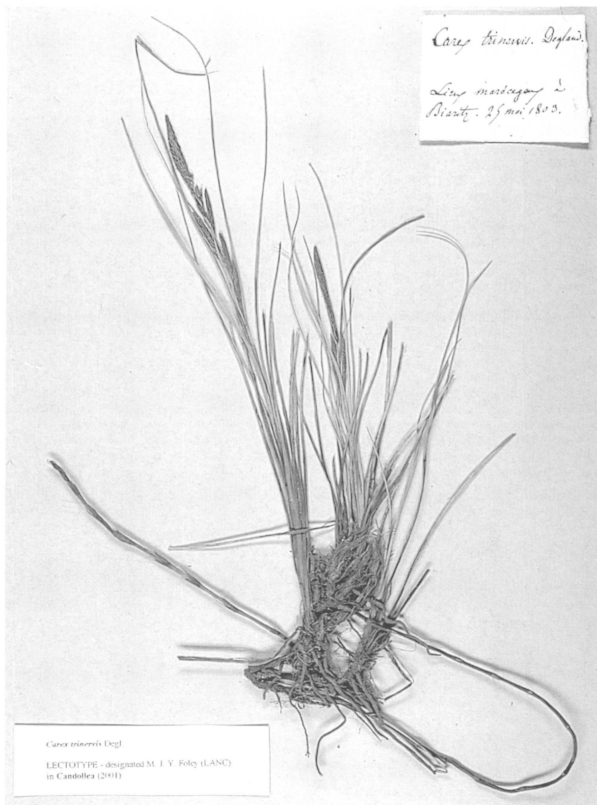
Fig. 2. – Lectotype of Carex trinervis Degl.