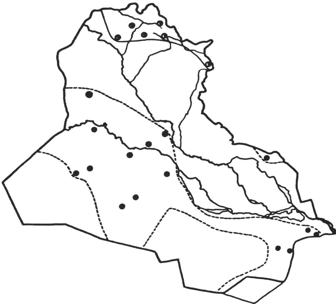
Map 6. — ● Cutandia dichotoma ; ○ Catapodium rigidum .

According to Bor (1968) rare in the lower forest zone of Iraq.