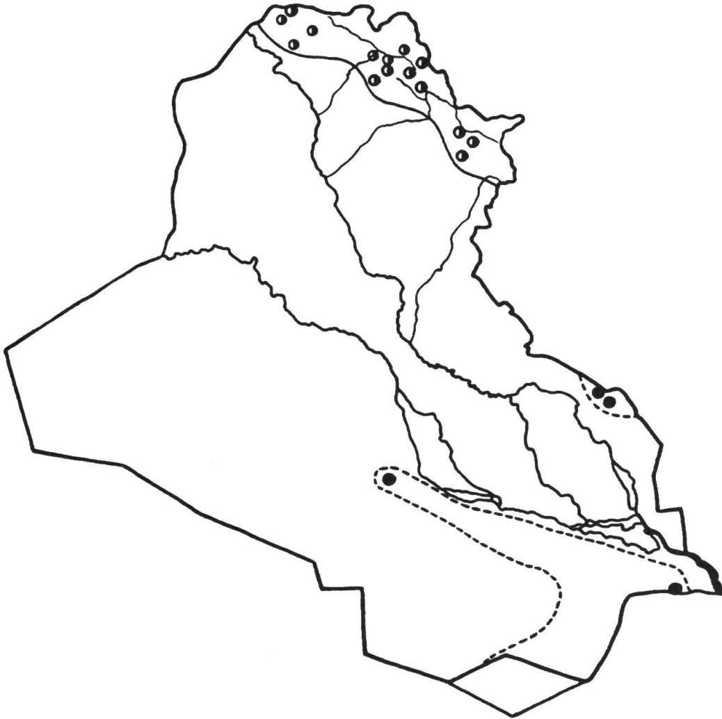
Map 5. — ● Cenchrus ciliaris ; ○ Brizochloa humilis .

MSU: Pira Magrun above Zawiya, limestone, 21.10.1960, Hadač 2814; Azmir dagh, 26.5.1960, Hadač 1888.