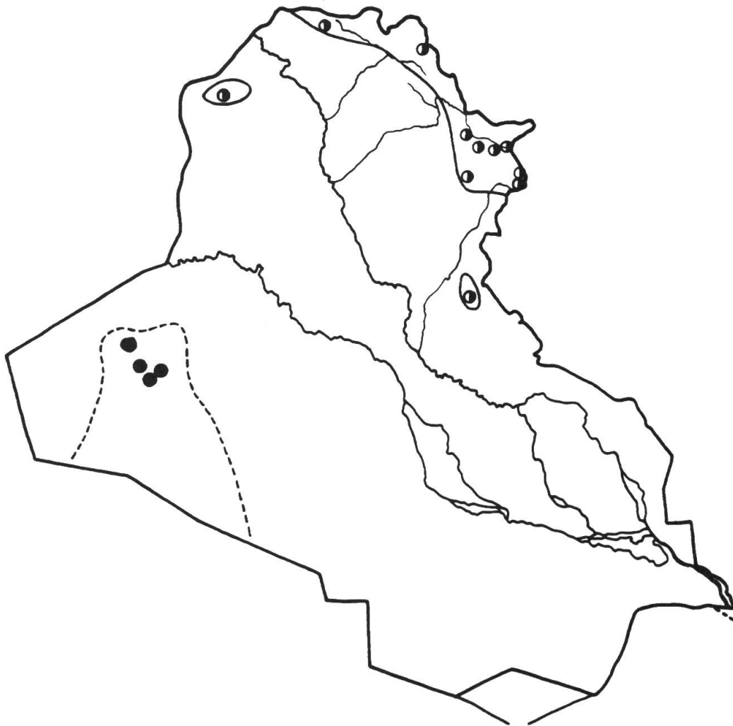
Map 3. — ● Stipa parviflora ; ⊙ Arrhenatherum kotschy . Stipa parviflora has a broadly Mediterranean distribution from Spain and North Africa to S Iran. In Iraq it is evidently restricted to the Artemisia herba-alba steppe region on cretaceous limestones near Rutba, with ca. 110-150 mm mean annual rainfall and \pm 19^{\circ}\text{C} mean annual temperature (absolute minimum -15^{\circ} , summer temperature \pm 30^{\circ}\text{C} ). Arrhenatherum kotschy is an Irano-Turanian element, restricted in Iraq to the region with more than 800 mm mean annual rainfall.