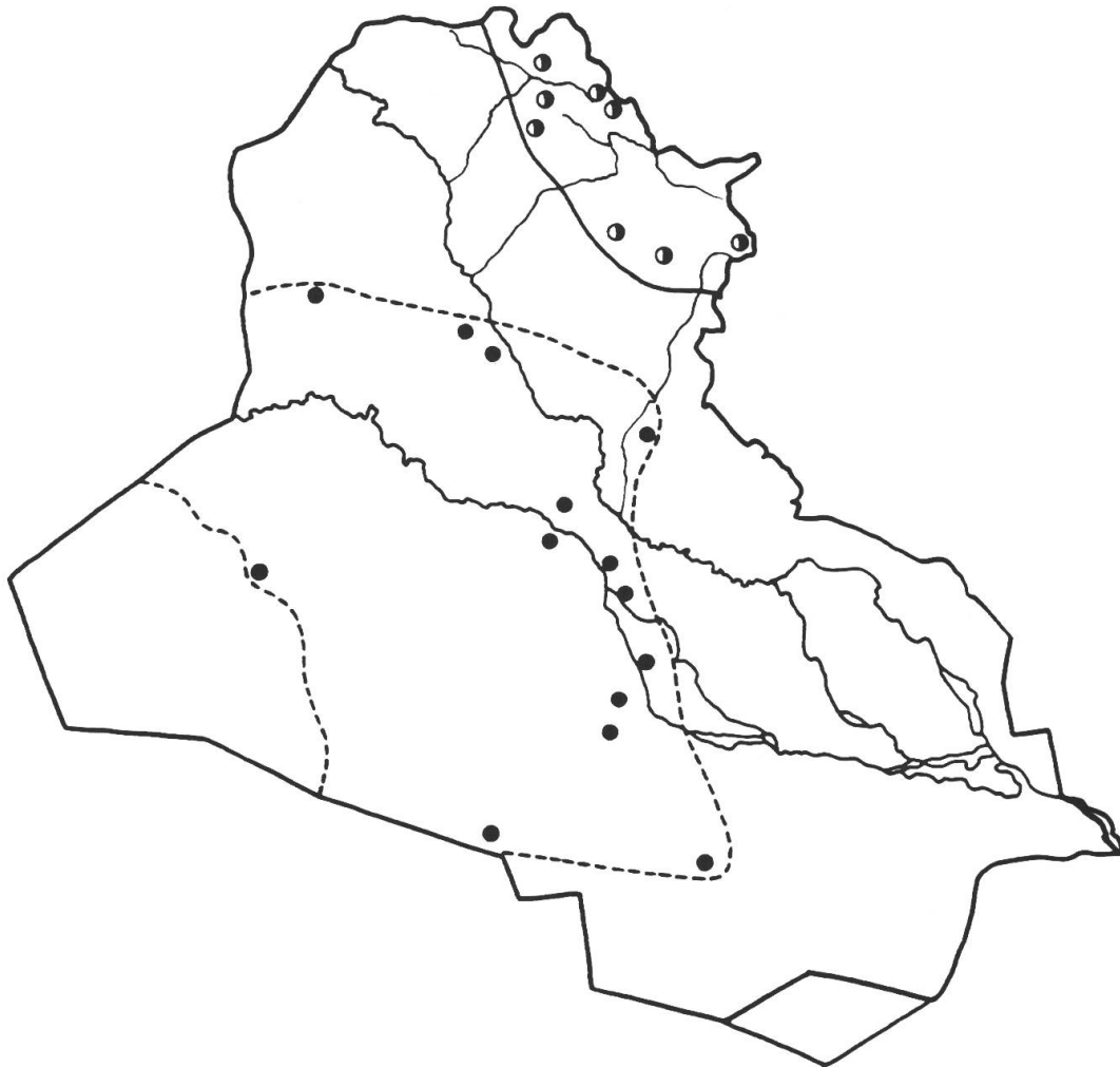
Map 2. — ● Ammochloa palaestina ; ○ Brachypodium sylvaticum . Ammochloa palaestina , according to Zohary (1950), belongs to the West Saharo-Sindian element, but as it occurs (cf. Bor 1968) from Spain through Morocco, Algeria, Tunisia, Libya, Egypt, Sinai, Palestine to Kuwait, Iran and Caucasus, it may be classified also as a Mediterranean element. In Iraq it grows in sandy places in the district of eocene and miocene rocks, lacking in the cretaceous limestone areas. It hardly exceeds the line of more than 200 mm mean annual rainfall, but on the other hand it is apparently lacking in the areas of extreme summer dry season or with excessive temperature maxima in summer. Brachypodium sylvaticum , according to Zohary (1950), belongs to the Eurosib.-Boreoam.-Médit.-Irano-Turanian element (but in North America it is only introduced). In Iraq it does not descend below the 500 mm isohyete of mean annual rainfall.