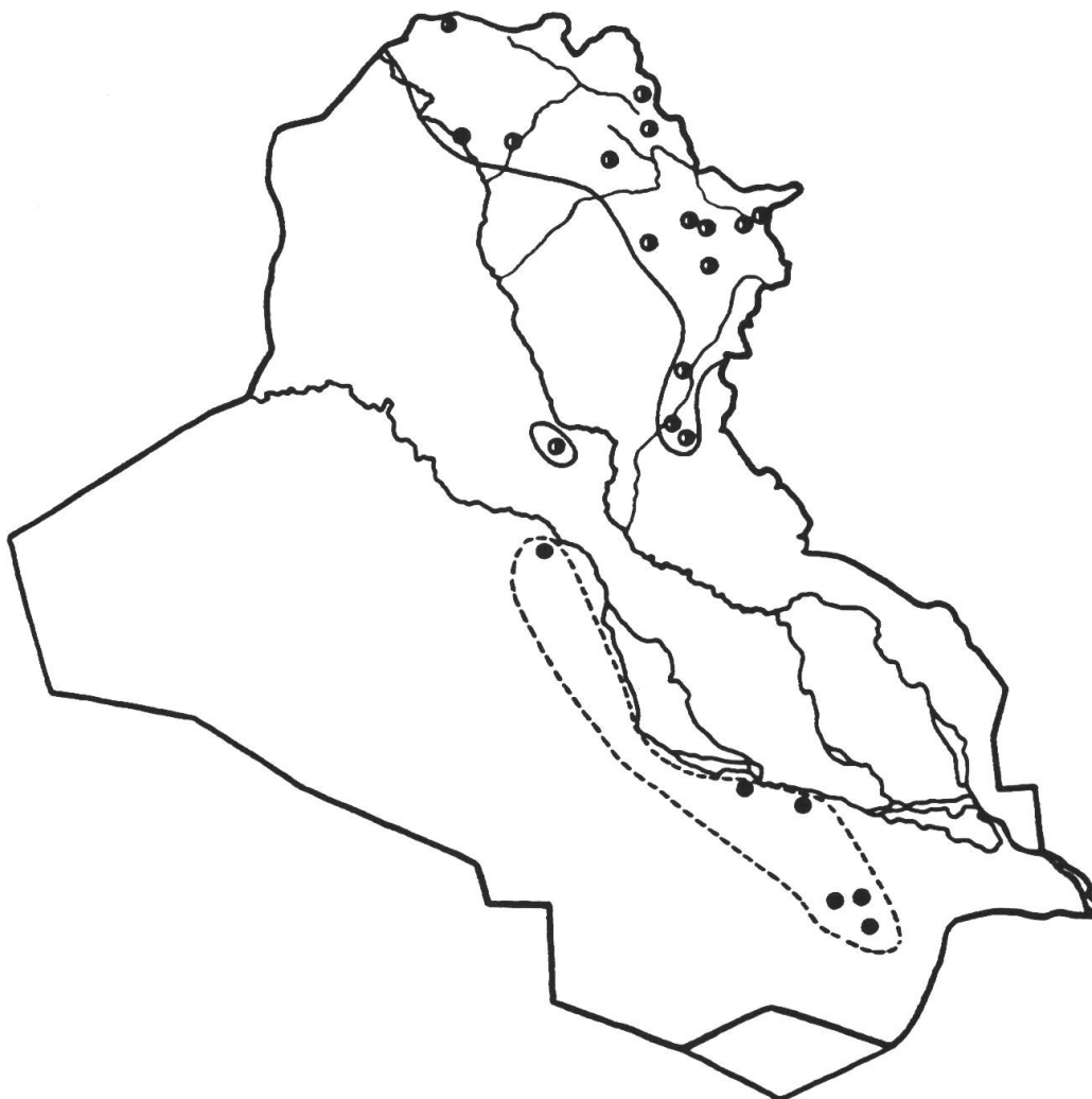
Map. 4. – ● Asthenatherum forskalii ; ● Calamagrostis pseudophragmites Asthenatherum forskalii is distributed from Central Sahara and N Africa to W Pakistan and Central Asia; it seems to be restricted, in Iraq, to sandy places in the district of miocene rocks with mean annual rainfall about 80-150 mm and summer temperatures above 30°C. Calamagrostis pseudophragmites is an Euroasian species. Living in wet places, it does not seem to be so directly dependent on annual rainfall as the other mapped grasses. It occurs in a region with ca 150-1000 mm rainfall.

Scattered in the oak woods, ascending nearly to the timberline.