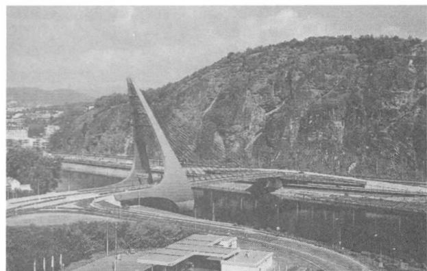
Fig. 3 Overall view towards the Marian Rock

In the case of the Marian Bridge it was on one hand the close cooperation of the bridge and traffic engineers with the architect and on the other hand the will of the city to build the bridge, which has next to the medieval castle become a new symbol of the modern era as a part of the environment and everyday life of city residents and its visitors.