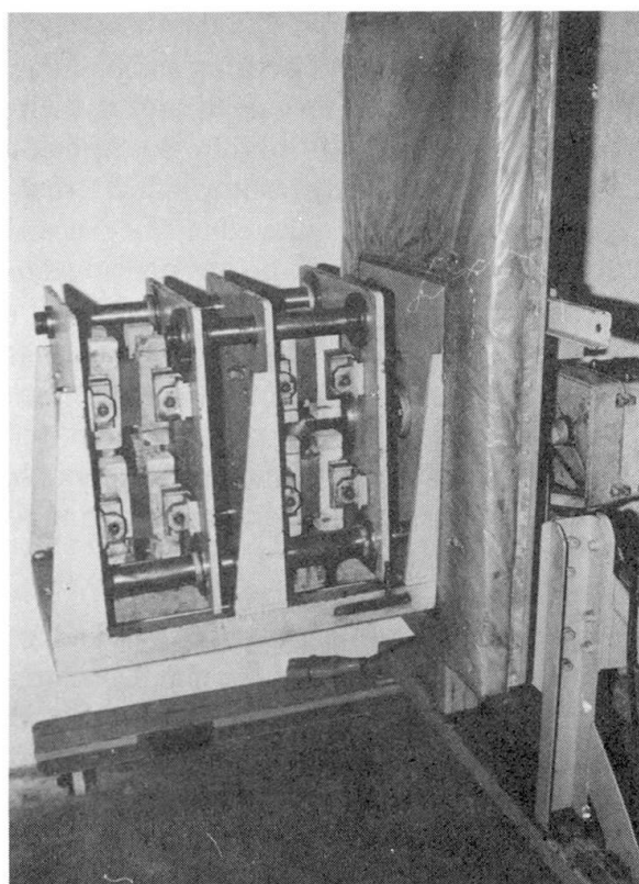
Fig. 2 Extension/compression test machine

The long-term durability of the elastomer jointing strips tested turned out to be very high. In order to be able to assess this property in the case of the addition of colouring agents and other formula changes, or even completely new formulae, new rapid tests are necessary. The authors are working on the general problem of the artificial ageing of elastomeric building sealants. However we shall not be reporting on this at this stage, but at the CIB World Building Congress which takes place in Gävle (Sweden) from 7 to 12 June 1998.