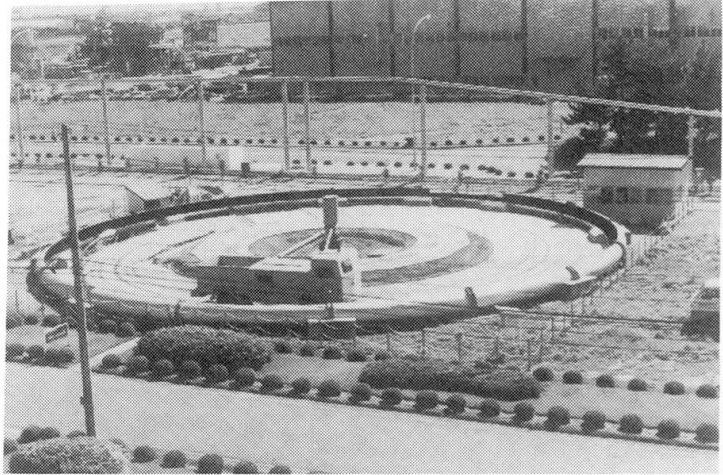
Photo.1 Test View

Figure 1 shows variations of elastic deflection under the central rear wheel load, which mean the degradation of stiffness of slab. Non-repaired slab No.5 collapsed at about 160000 cycles, and slabs Nos. 1 and 3 with the same loading condition as No.5 were repaired at 17000 and 160000 cycles, respectively. While, slabs Nos.2 and 4 subjected to a lighter loading condition were repaired at earlier stages of 5000 and 17000 cycles, respectively. All test slabs except No.5 did not collapse until 600000 cycles when the tests ceased.