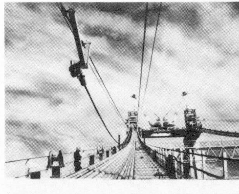
Erection of cable

The height of other strands were adjusted to this standard strand. These adjustments should be done at around midnight when the temperature of each strand were uniform. The void ratio of main cables, which indicates how the wires were compacted, are within 20% as specified.