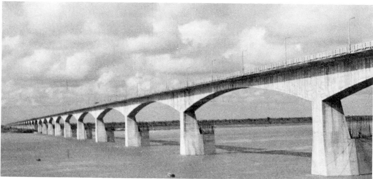
Fig. 2 A View of the Completed Bridge (First Two Lanes)