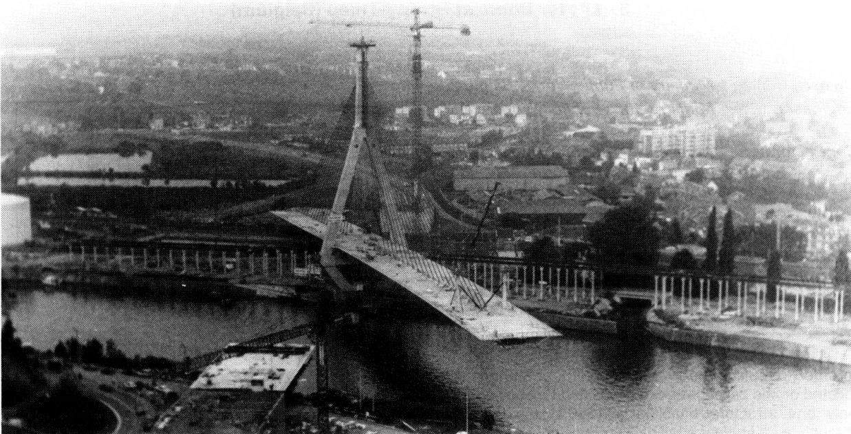
Fig. 2: The Ben-Ahin Bridge