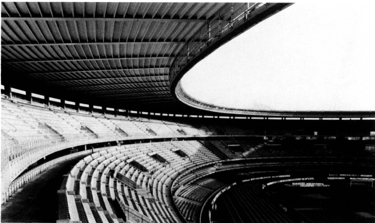
Fig. 2: The completed stadium in Verona (view from inside)