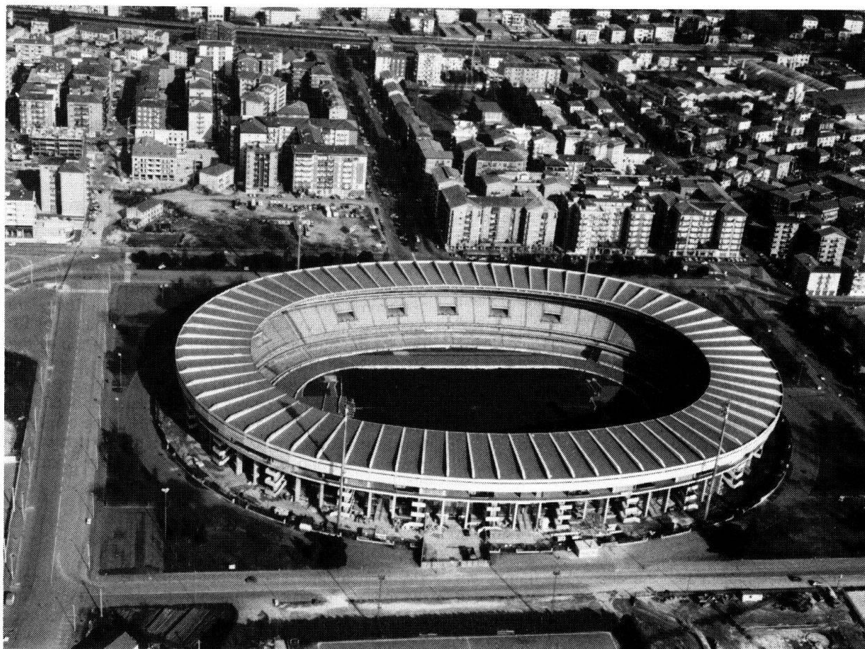
Fig. 1: The completed stadium in Verona (aerial view)

The insertion of the new tiers ring has not lead to noticeable changes in the surrounding urban environment, but, if anything, to an enrichment from the monumental point of view.