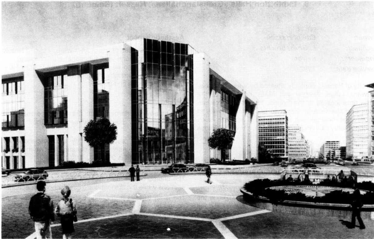
Fig. 2: Facade of the building

The South-East corner of the «Secretariat» building is supported by the top slab of a new road tunnel.