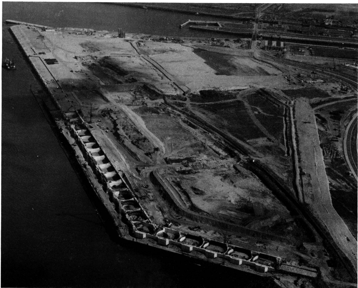
Fig. 1: Overview

The caissons have an outer diameter of 29 m and a wall thickness of 0.95 m. The foundation level is at 21.00 while the river bed in front of the quay wall is dredged at level of 14.30.