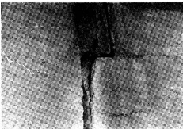
Fig. 1 Distress at articulation

In a particular span (No. 6), distress noticed in suspended span at articulation was of higher magnitude. Large chunks of concrete were found separated in the span from the cantilever tips and the suspended span had therefore settled by about 40 mm. In most of the articulation tips, wide cracks had developed.