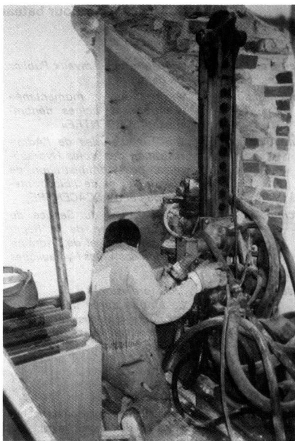
Fig. 2 Through excavations in the supportive brick walls holes were sunk vertically through the basement walls.

(I. Varstela, P. Roitto, M. Haapala, M. Rasilainen)