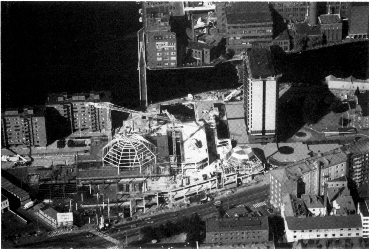
Fig. 3 Air photograph