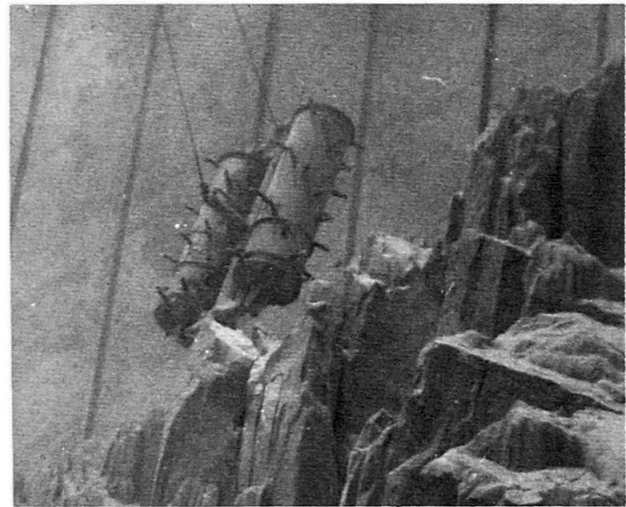
Fig. 1 Potash hanging up on silo wall (It will not flow prior to installation of reclaim system)

Once it had been determined that the Eurosilo system could dig and reclaim the potash at the required reclaim rate we set about planning the retrofit.