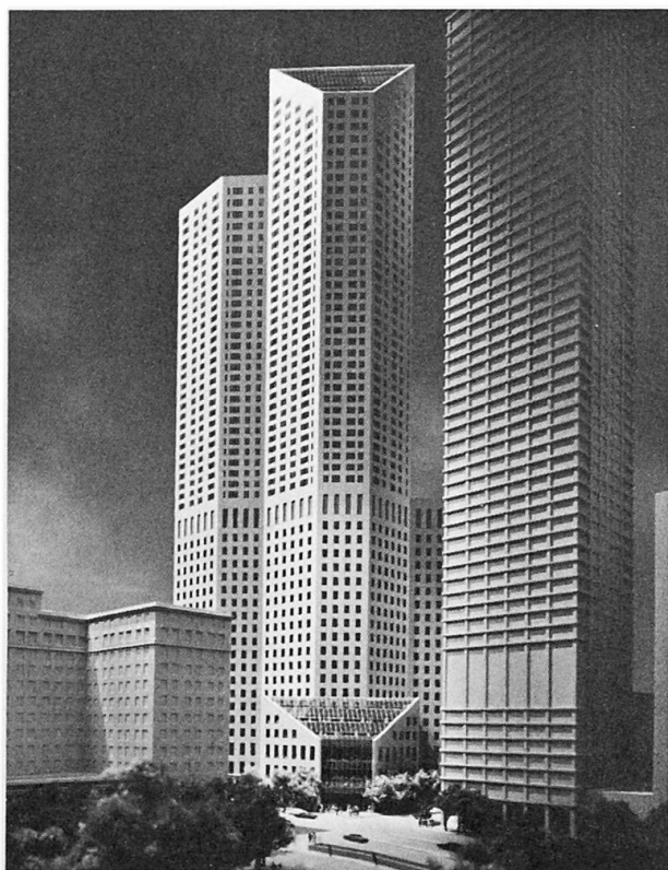
Fig. 1 One Magnificent Mile building, Chicago, Illinois — A rendering

A three-dimensional model was used to analyse and optimize the structure under gravity and wind loads. Flat plate was used in condominium levels and flat slab with drop panel was used in office, parking and commercial areas. Concrete strength varied between 4,500 psi to 5,500 psi (31.03 MPa to 37.92 MPa). Due to the free form floor support layout, finite elements analysis of the reinforced concrete were carried out.