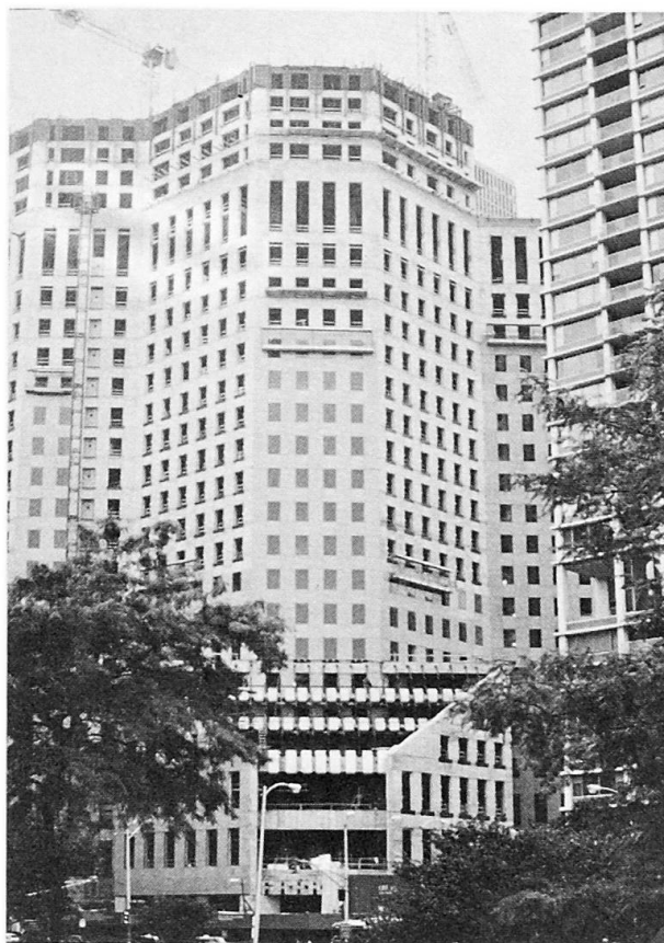
Fig. 4 One Magnificent Mile building under construction

Column concrete strength ranged from 8,000 psi (55.16 MPa) at ground level to 5,000 psi (34.47 MPa) at near roof levels. Columns have been instrumented to measure shrinkage due to elastic shortening, shrinkage and creep.