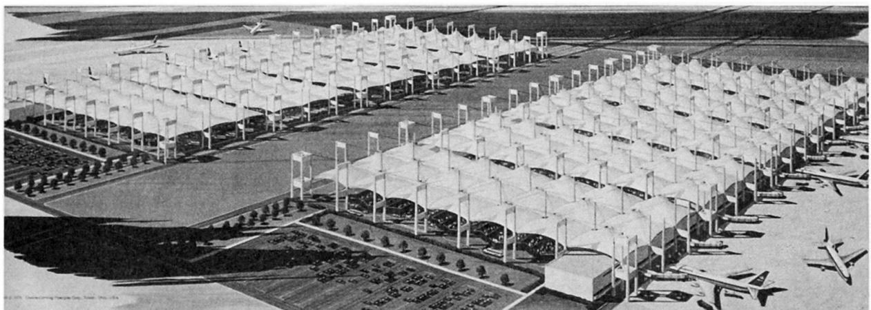
Fig. 1 Artists perspective of completed Haj Terminal

To be used as a structural element, the membrane material had to satisfy numerous performance criteria. In the past, fabric membrane materials had a relatively short life; consequently they were used in temporary structures. However, the fabric membrane for the Haj