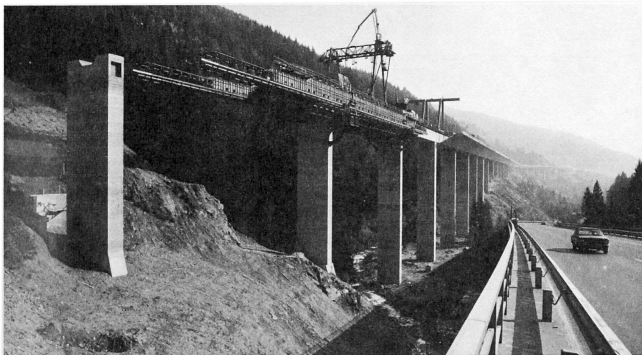
L 22 with launching girder