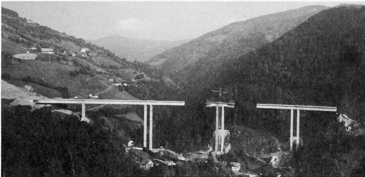
L 23 under construction