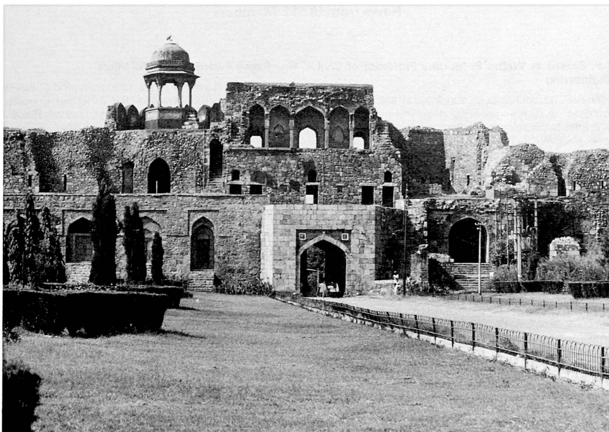
Tombeaux autour du Mausolée d'Humayab