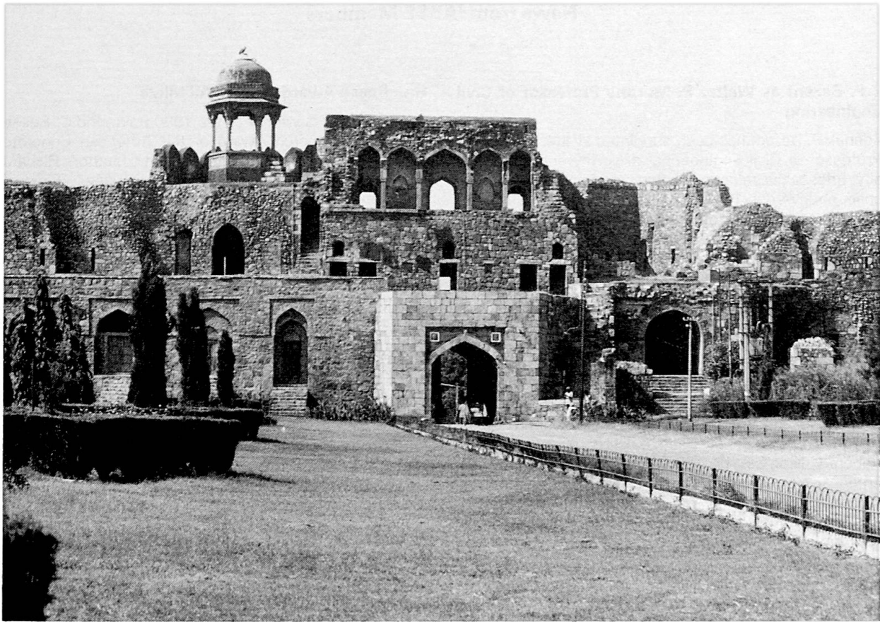
Tombeaux autour du Mausolée d'Humayab