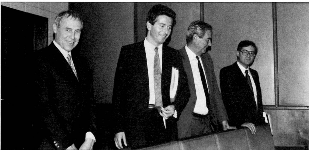
Checking meeting rooms after the Scientific Committee meeting, October 21, 1988.

The beginning of September is still part of the peak season in Lisbon and in Portugal, therefore members are encouraged to register early for the Symposium. Over 500 participants are expected in Lisbon: thanks to the topic, the location, and the recent history of IABSE Symposia (Tokyo 1986 and Paris-Versailles 1987, each with almost 700 participants) reigns an optimistic mood among the volunteers and staff preparing the event.