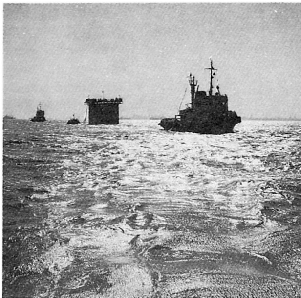
Fig.2 Caissons being towed in sea