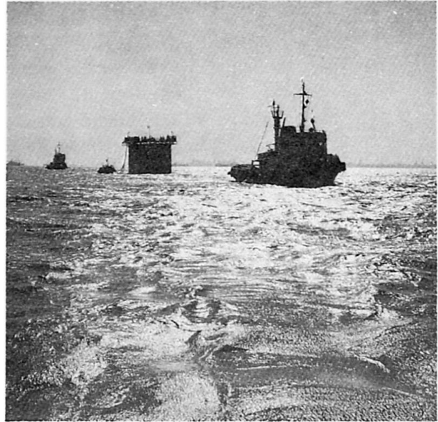
Fig.2 Caissons being towed in sea