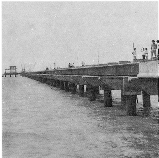
Fig.4 Piled Jetty