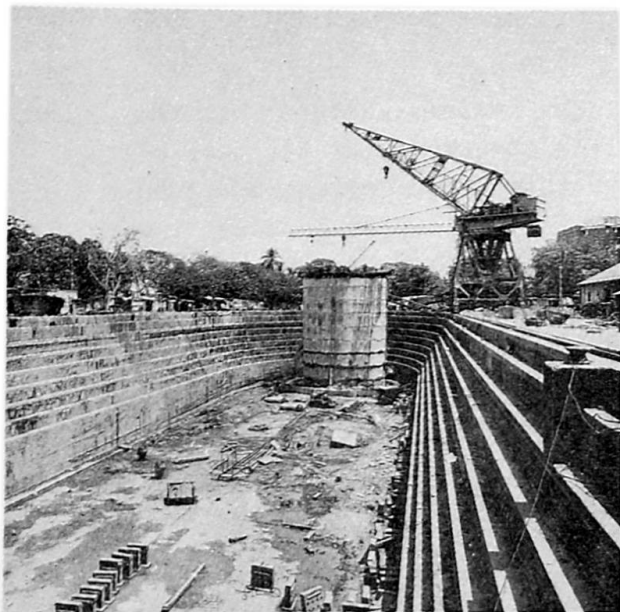
Fig.1 Caissons precast in dry dock

The owners of the project are Bombay Port Trust and the contractors were M/s. National Building Construction Corporation assisted by M/s. Christiani Nielson. M/s. STUP Consultants Limited provided design and construction consultancy to the contractors.