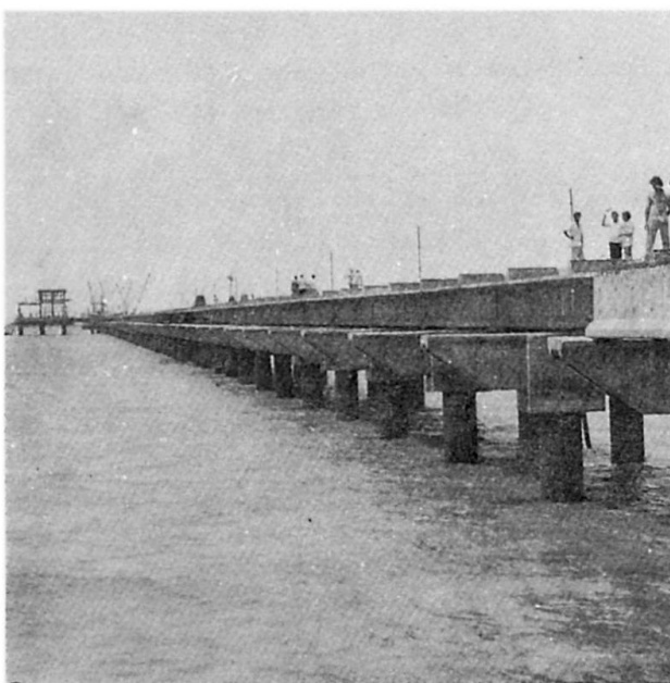
Fig.4 Piled Jetty