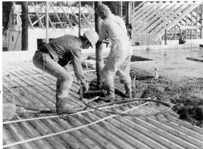
Fig.2 The fluted and spiked steel sheet is lightweight building element