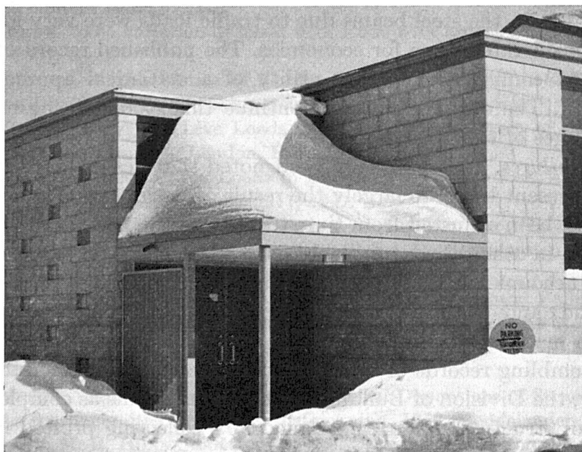
Fig. 3. A Triangular Snow Accumulation (Maximum Load 80 lb./sq. ft.) Resulting From Wind Action on a Building in an Area with a 50 lb./sq. ft. Design Load.

At present the wind load requirements of the National Code Building take into account three factors — the gust velocity, the increase of velocity with height, and the shape of the structure.