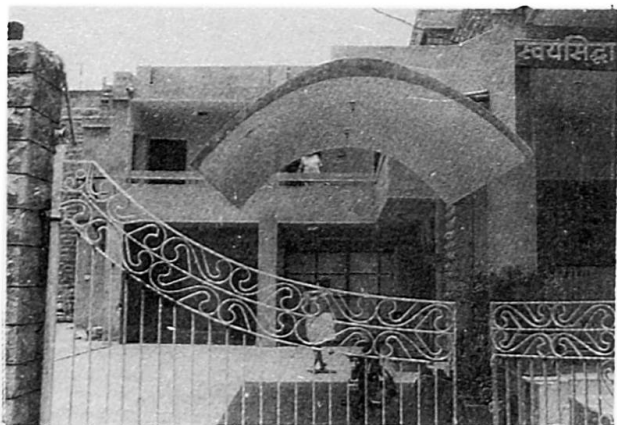
Fig. 2 Front view of hood