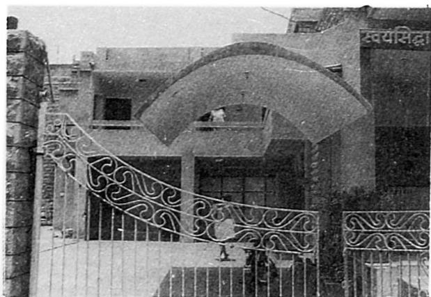
Fig. 2 Front view of hood