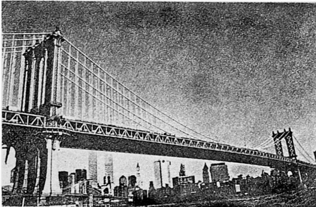
Manhattan Bridge, New York, USA

Project Engineer Steinman Consulting Engineers New York, NY, USA