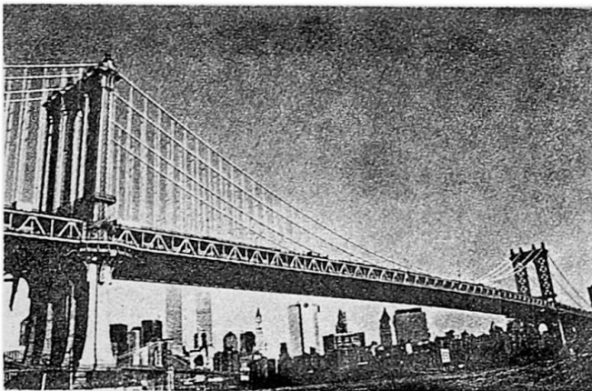
Manhattan Bridge, New York, USA

Project Engineer Steinman Consulting Engineers New York, NY, USA