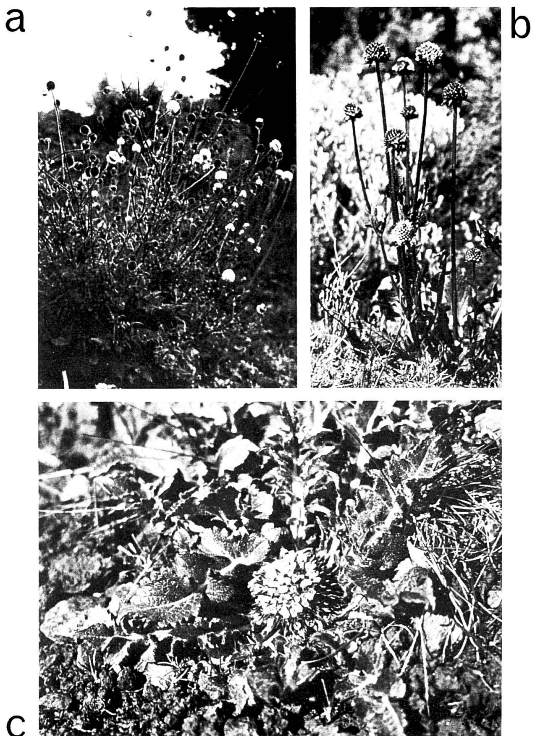
a-c: Ethiopia, Bale Prov., Bale Mts National Park, Dipsacus pinnatifidus Steud. ex A. Rich. at various altitudes, photographed by O. Hedberg, October 1973. a, National Parks Headquarters, 3200 m, in Hypericum woodland, stem about 2 m tall. b, near Garba Goracha Camp, 3950 m, in alpine scrub, stem about 0.3 m tall. c, Mt Batu, 4150 m, on exposed ridge, stem about 2 cm tall.