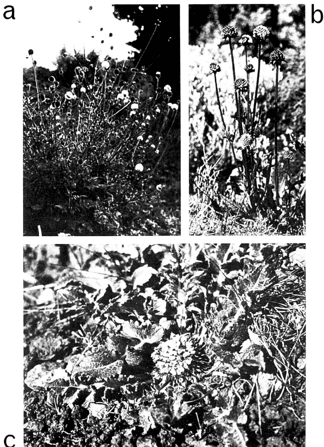
a-c: Ethiopia, Bale Prov., Bale Mts National Park, Dipsacus pinnatifidus Steud. ex A. Rich. at various altitudes, photographed by O. Hedberg, October 1973. a, National Parks Headquarters, 3200 m, in Hypericum woodland, stem about 2 m tall. b, near Garba Goracha Camp, 3950 m, in alpine scrub, stem about 0.3 m tall. c, Mt Batu, 4150 m, on exposed ridge, stem about 2 cm tall.