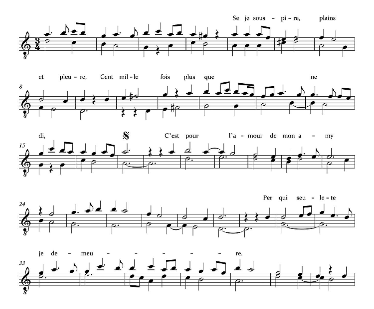
Ex. 3a: Binchois: Se je souspire, plains et pleure.

mode purely in terms of its tenor, as Tinctoris was to do perhaps half a century later.