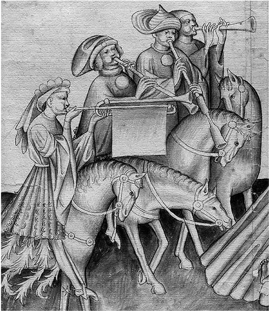
Figure 2: Detail of Tournament Scene , on the left: four mounted wind players , ?Workshop of Giacomo Jaquerio, ca. 1420–1430. Erlangen, Graphic Collection of the University, H62/B 16.