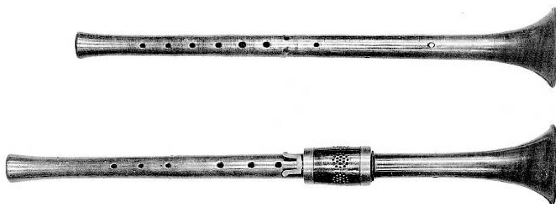
Figure 1: Treble and alto shawms in the Kunsthistorisches Museum, Vienna, Sammlung alter Musikinstrumente: SAM 179 (anonymous) and SAM 182 (Hans Rauch von Schratzenbach).

The developed treble shawm thus represents a marvel of engineering – one all the more remarkable when we consider that on it the same chromatic capabilities as those found on the Baroque oboe were achieved completely without the use of keys. Just how early the development might have taken place is still a question; I suspect it might have been as early as the beginning of the 15th century, since there are paintings from the first half of the century that attest to the difference in layout that we have observed in the surviving 16th-century examples. 10