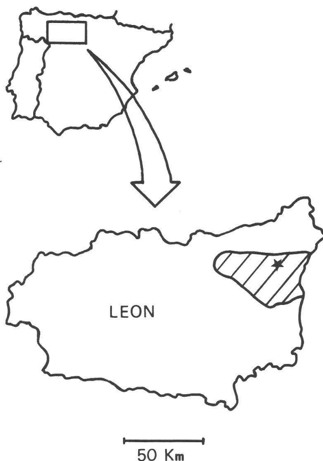
Figure 1. Distribution of Quercus pauciradiata in the province of León (stripped area) and localization of the Q. × andresii (star).

LEB 63262 and LEB 63263. Paratypes: Proximidades de Cistierna (30TUN2744), en lindero de quejigar, 980 m, 31-8-1997, leg. R. Alonso 4017, LEB 63439. Proximidades de Cistierna (30TUN2744), en sebe con restos de saucedá-fresneda, 980 m, 3-6-1998, leg. R. Alonso 4213, LEB 63256. Id. R. Alonso 4214, LEB 63257.