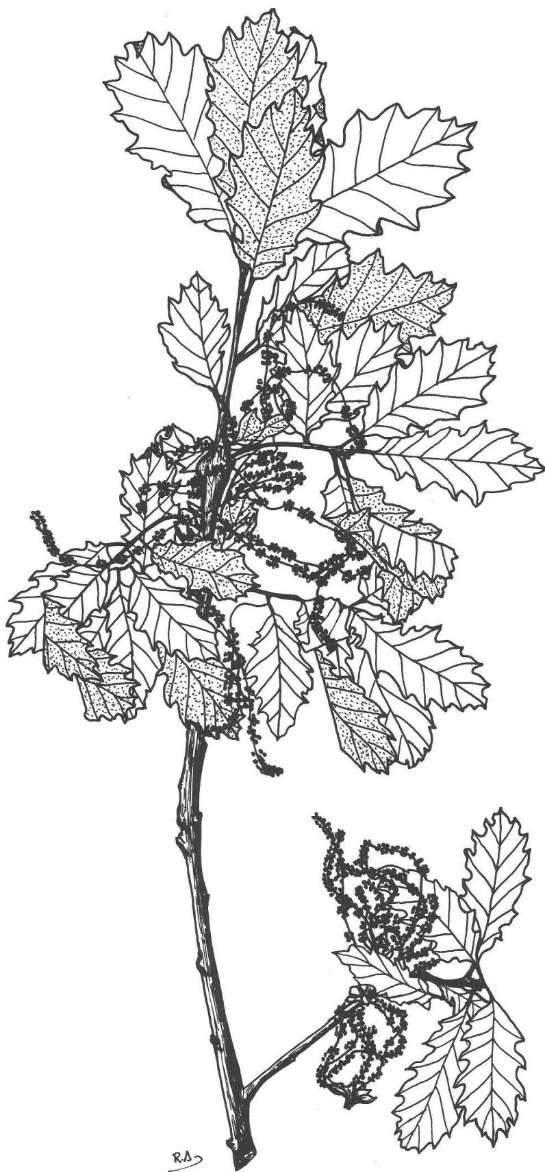
Figure 2. Leaved twig of Quercus × andresii from the holotypus.