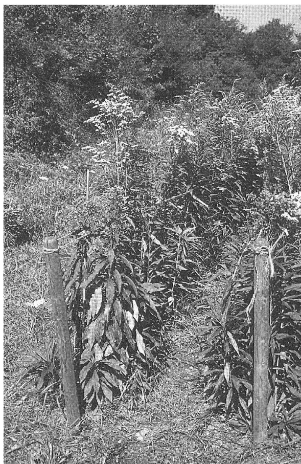
Fig. 1. The experimental garden at Höggerberg, Zurich, at the end of the season

sampled in eastern and midwestern USA, and populations from the introduced range in Central Europe. Seeds were collected either as separate seed families or as bulk samples (small populations). In the first case distances between mother plants were kept large enough to ensure that seed families originated from different genets. Seeds were stored at room temperature until germination.