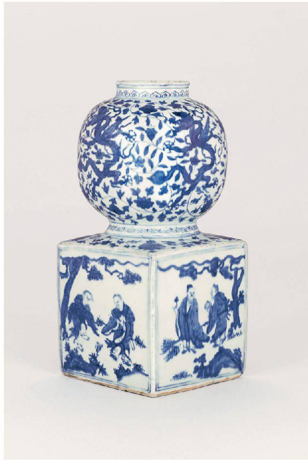
Plate D: A blue and white double-gourd vase decorated with the Eight Immortals and winged dragons. Jiaping six-character mark and of the period (1522–1566), height 32 cm.