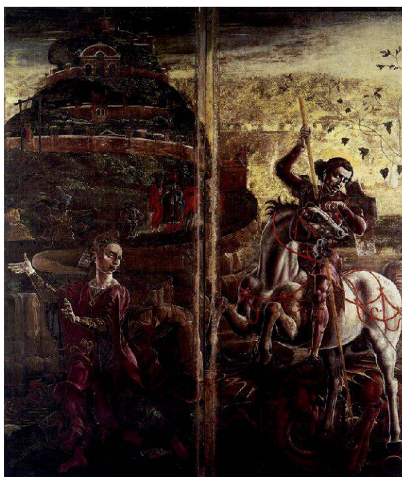
Plate E: Cosmé Tura, Saint George and the Princess (detail), 1469. Tempera on canvas, 349×305 cm. Ferrara, Museo del Duomo.