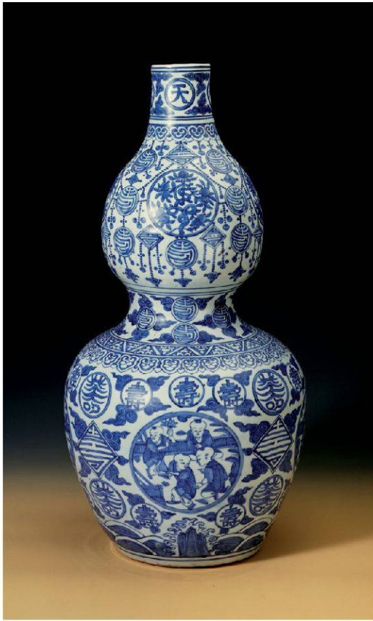
Plate C: A blue and white double-gourd vase decorated with shou 壽 characters and playing children. Jiaping period (1522–1566), height 62.2 cm.