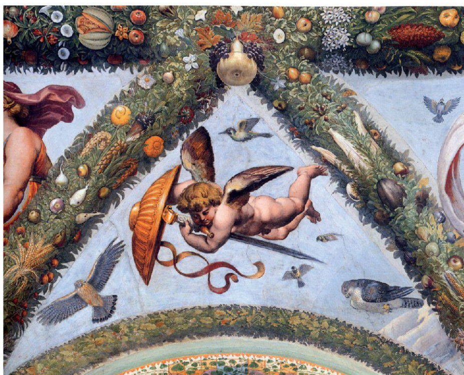
Plate F: Raphael (1483–1520) and Giovanni da Udine (1487–1561). Amor with the attributes of Mars , in the Loggia of Cupid and Psyche (Vault, 1518). Rome, Villa Farnesina.